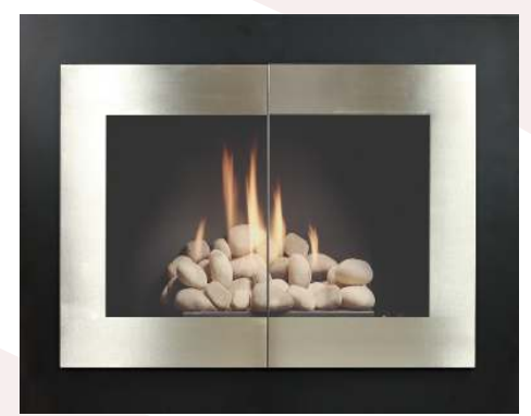
Regular Frame Manhattan