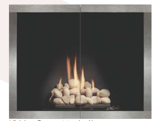
Hidden Frame Manhattan