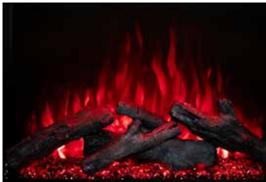
Red Flames - Logs off