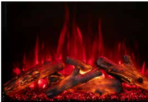
Red Flames - Logs on