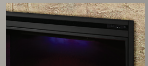
SELF TRIMMING FLANGE