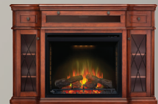
DECOR SERIES MANTEL PACKAGES