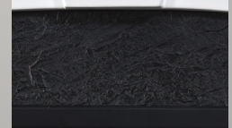
BRUSHED ALUMINUM RECTANGULAR ACCENT POSTS