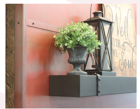
Shown in Antique Red

Antique Black Antique Steel Antique Red Antique Grey Antique Bronze Antique White Burnished Bronze Burnished Copper Burnished Silver Metallic Latte Rust Patina Hot Roll Natural Industrial Black Brushed Stainless