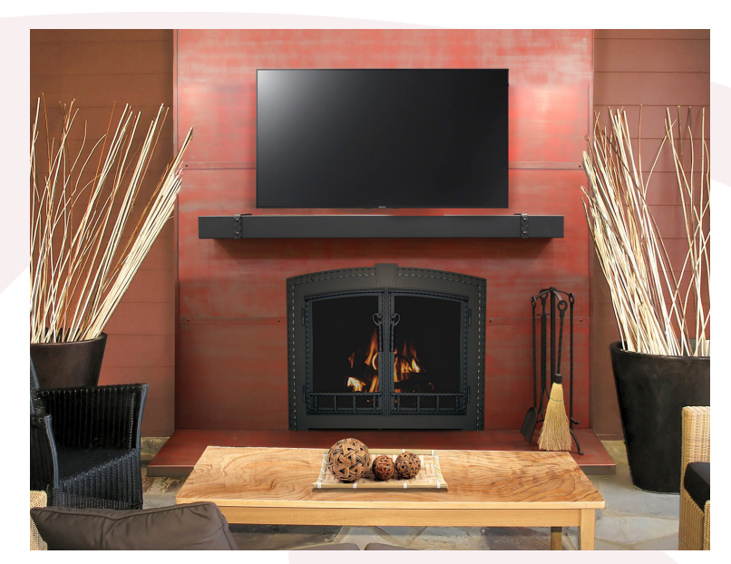
horizontal wall panel