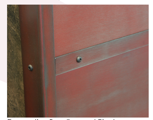
Decorative Banding and Rivets