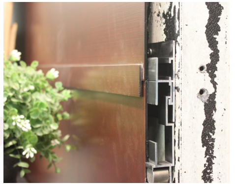
Simple Track Mounting