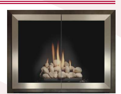
Antique Black & Brite Nickel