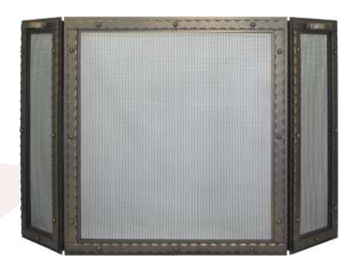
Blacksmith Triple Panel