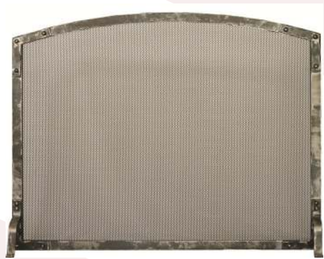
Old World Arch