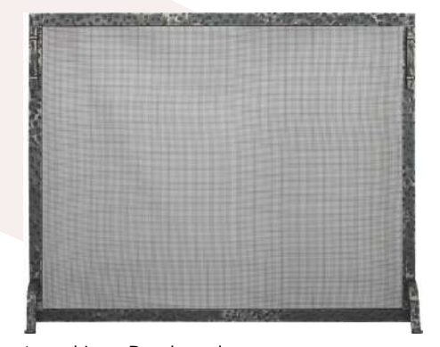
Aged Iron Rectangle