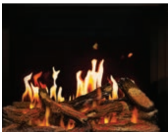
Gas with MIRROFLAME Reflective Panels