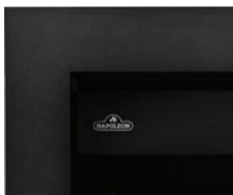
Adjustable Finishing Trim accommodates different thicknesses of finishing materials