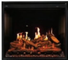
Elevation X Electric