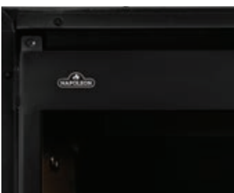
Frameless Finishing Flange for clean and adjustable installation options