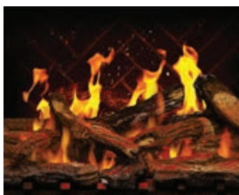
Premium glowing split oak logs