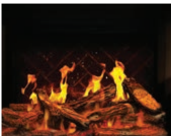
Wood with Westminster Herringbone Panels